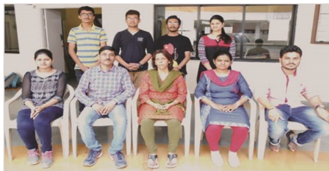
Editorial Committee with Principal