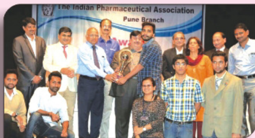
National Pharmacy Week: All India Shri Shivaji Memorial Society's college Of Pharmacy secured overall first position at post graduation level & second position at under graduate level in national pharmacy week organised by Indian Pharmaceutical Association.