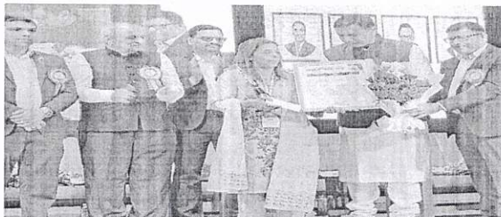
Best Active College Award (15/02/2025)

Management has been continuously supporting and encouraging one and all activities of this college. Without the wholehearted Management backup, we would not have been what we are today. Our sincere thanks are due to management