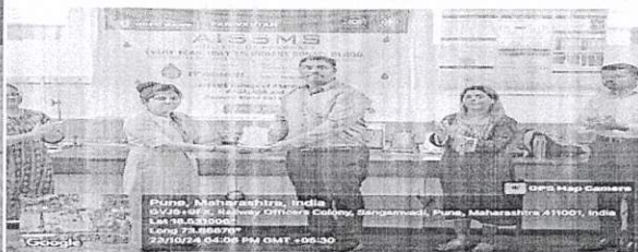
Blood donation camp (23/10/2024)