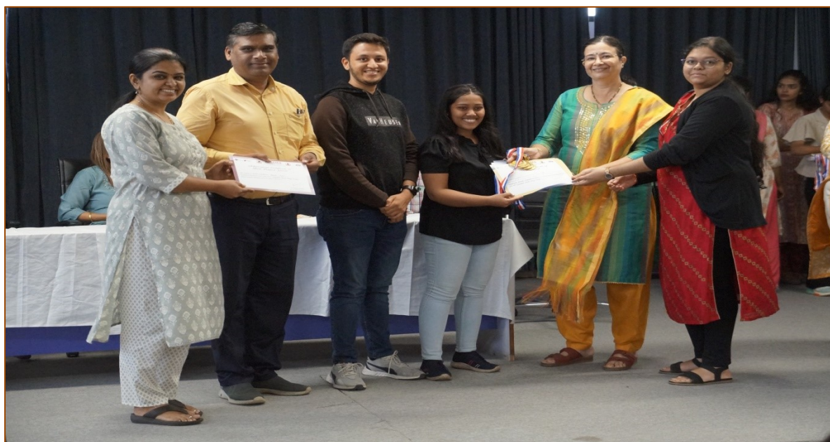
Photo during receiving of The Vigyaan Chetana award

External examiners were appointed for the fair evaluation of the project work, the result of the best project award to students and their respective guide are given below. The certificates and medals were given for the best project in each subject to students and their guide in the prize distribution function held on dated 12.06.2024.