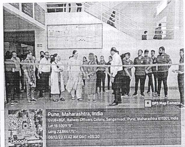
New Voter ID registration activity -08 Dec. 2023