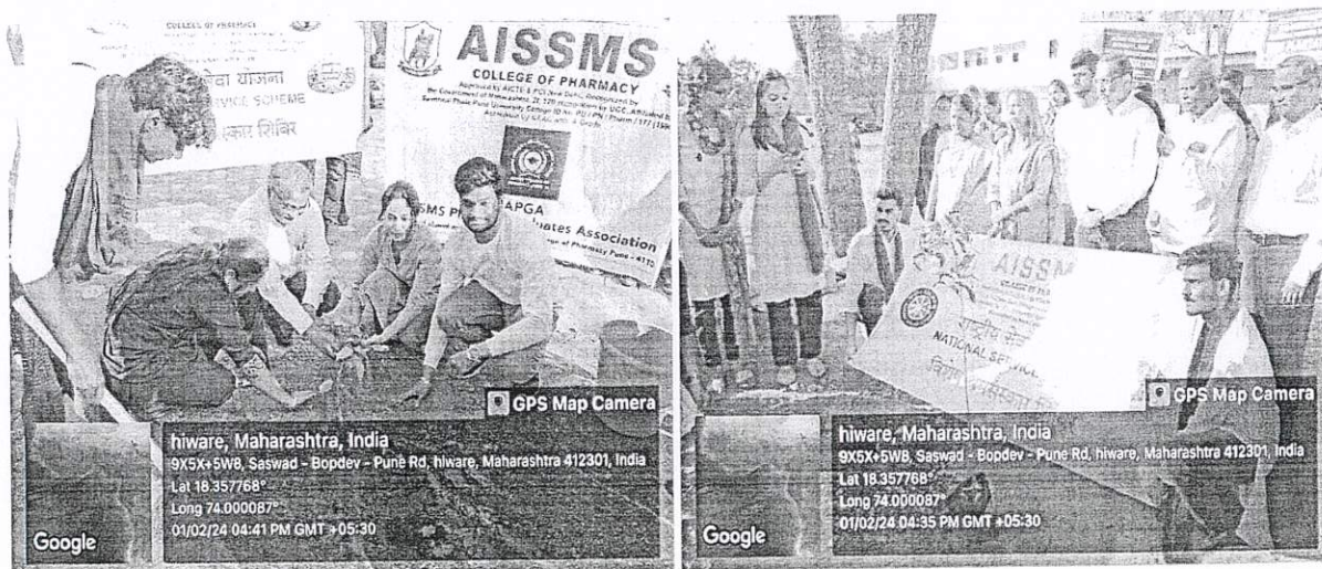
NSS -Tree Plantation by students at Hiwara Gaon - 01/02/2024.

Management has been continuously supporting and encouraging one and all activities of this college. Without the whole hearted Management backup we would not have been what we are today. Our sincere thanks are due to management