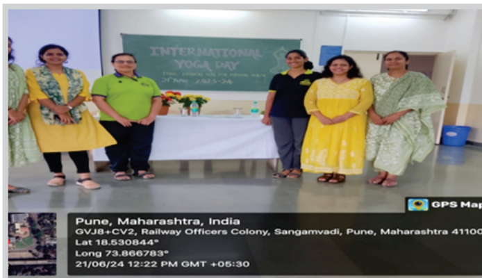
Yoga Day celebration with Yoga Teachers from Niramay Yog Chikitsa Kendra,Pune

“Do the difficult things while they are easy and do the great things while they are small . A journey of a thousand miles just begin with a single step.”