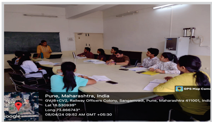
IPR Day 2024