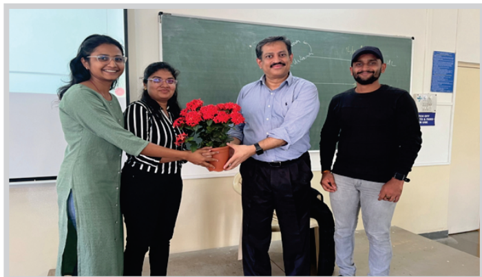
Felicitation by Class representatives