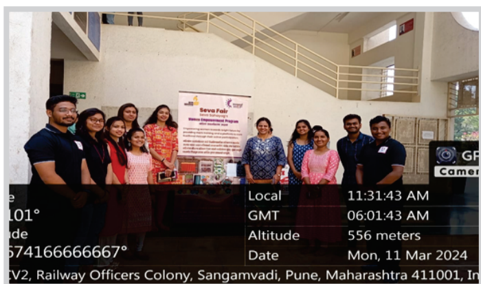
Glimpses of Seva Fair Stalls on Internal Women's day, as a part of Women's Empowerment

Assistance in Women Empowerment through sale of products prepared by them.