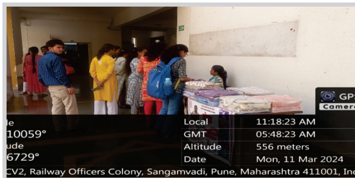
Students are seen purchasing the products at the Seva Fair expo