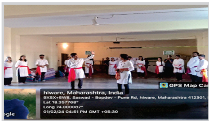
Street Play on Glory of India

The villagers responded with great enthusiasm. Our students also performed a patriotic song to show their love and respect for our nation. The program was successful in proving the spirit of the people living in rural areas and earned great response and appreciation from the people.