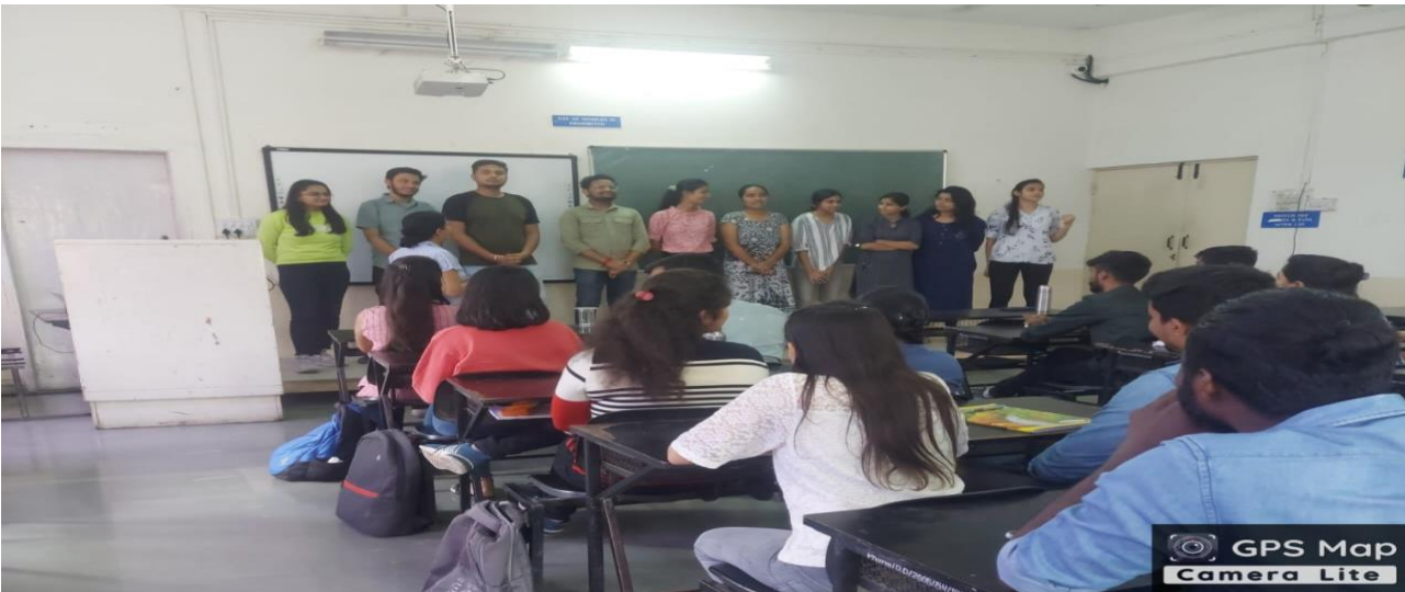
Shop 1 Aissms Clg Road, Railway Officers Colony, Sangamvadi, Pune, Maharashtra 411001, India