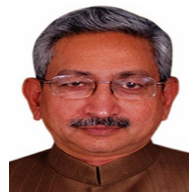
Shri. Shahu Chhatrapati Maharaj President

I would like to congratulate the College of Pharmacy for this initiative taken by it, in ensuring the over-all development of the students and the others associated with it.