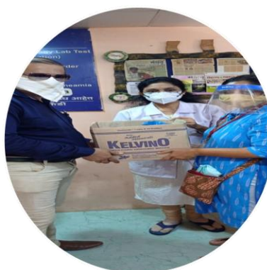
Hygiene Kits to the needy via Soham Trust, Pune