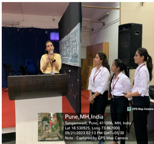
In-house project competition held at AISSMSCOP on 21/09/2023