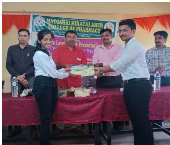
MMCOP, State Level Poster competition (3rd Prize) Sept 2022