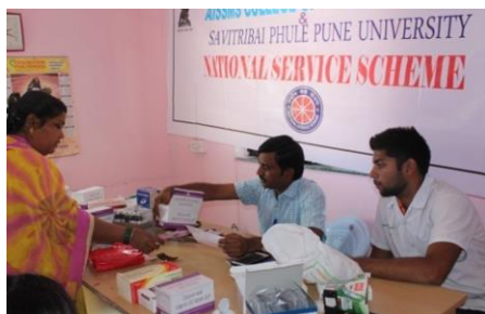
Health check-up camp for villagers