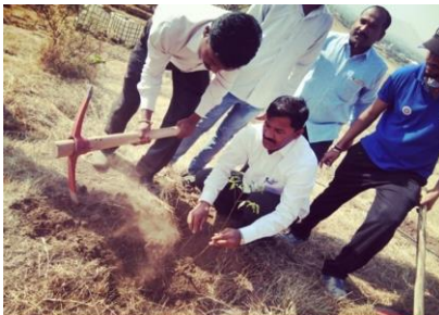
Tree plantation with the involvement of villagers