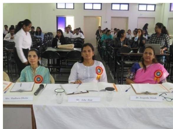
SYNAPSE (Nov. 2022), UG session in Progress