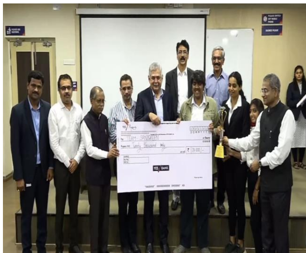
Pharmathon organized by MIT's School of Pharmacy, 2022