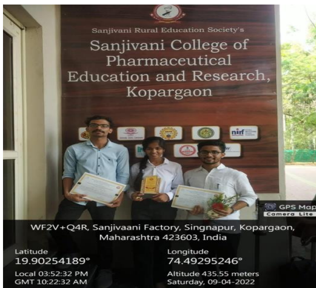
SCOPER, Ahmednagar (1st Prize) 2021-2022