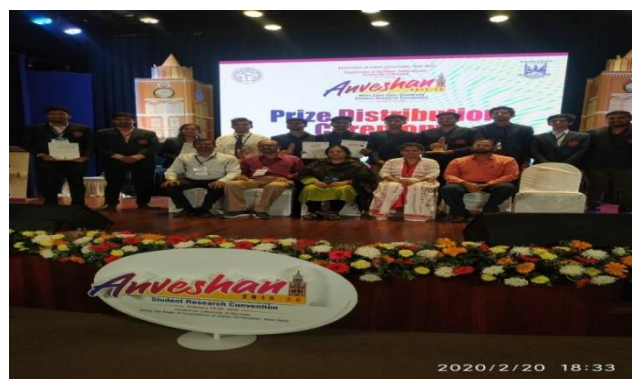
Third prize in 2019-20 at Inter University research competition Anveshan in Health Sciences category, organized by Association of Indian Universities.