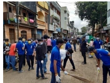
Kolhapur flood relief works for Awareness of social responsibilities