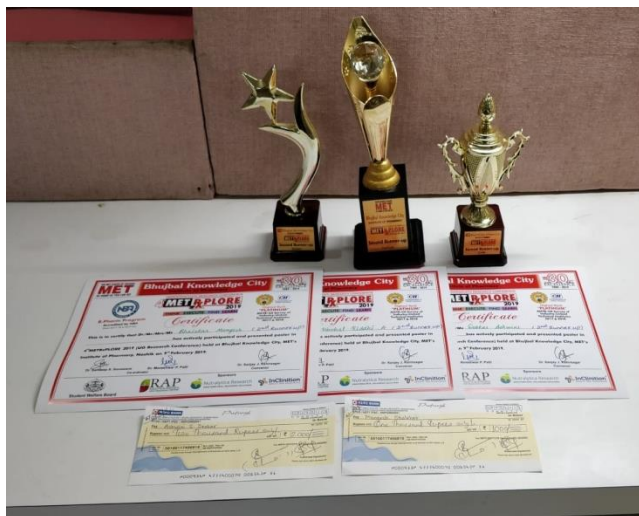
Runner up at METxplore 2019

> Cardiovasc Hematol Disord Drug Targets . 2023;23(1):21-30. doi: 10.2174/1871529X23666230414084918.