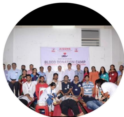
Blood donation drive