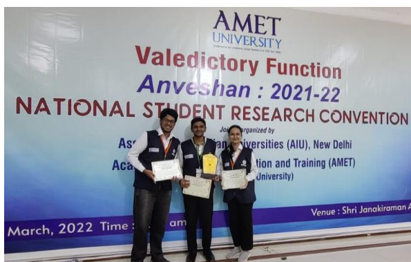
First Prize in 2021-22 at Inter University research competition, Anveshan, in Health Sciences category, organized by Association of Indian Universities.