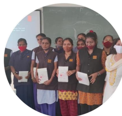
Lecture on Menstrual hygiene and gift of sanitary Napkins through Seva Sahayog NGO