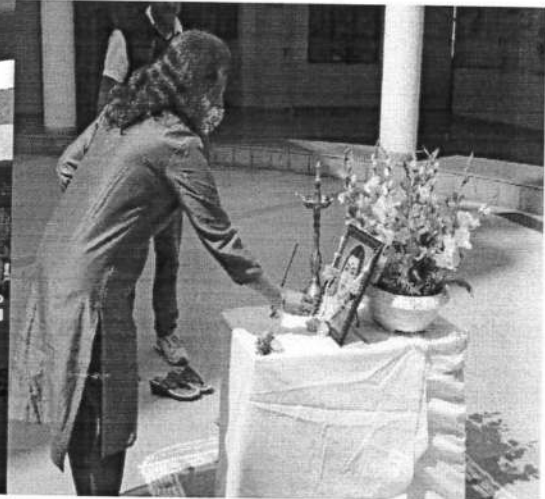
Savitribai Phule Mohotsav Date and Day: -14/02/2022 (Monday)