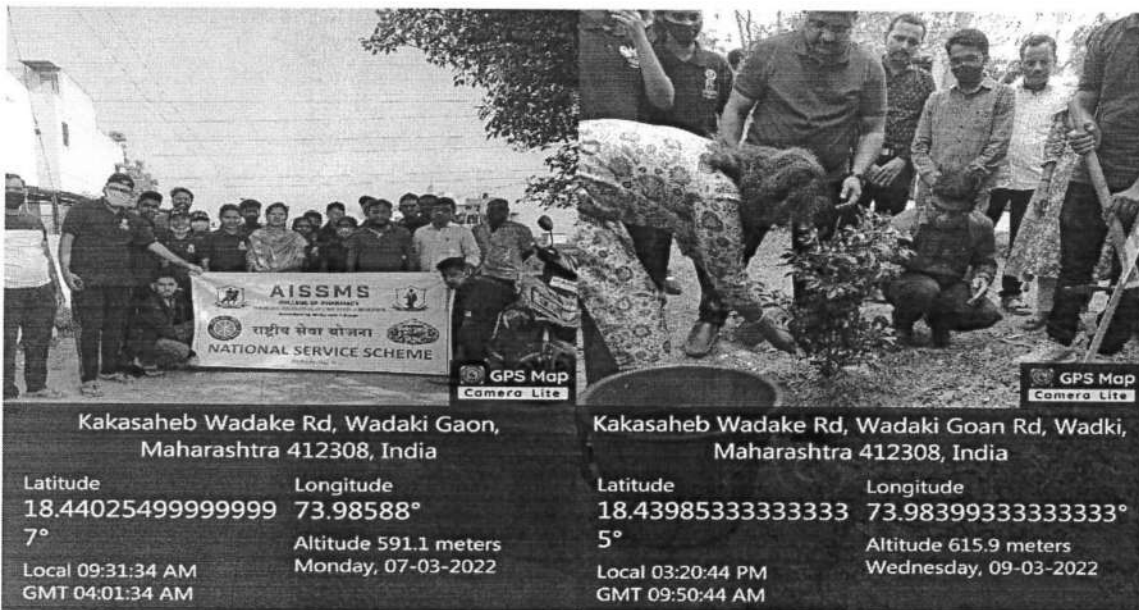
NSS- Cleaning Drive at Wadki Village