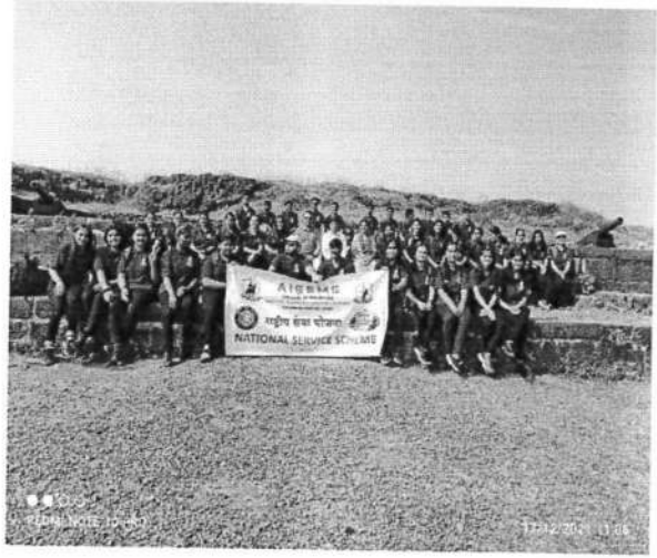
Lohagad FORT VISIT