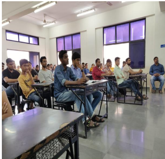
Audience during the session