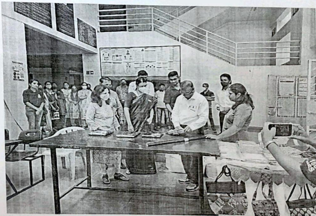
Inauguration of Seva Fair Stall 2022